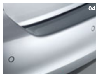
04 Rear parking sensors.

Safety and security have to be a primary consideration, for only when you are feeling totally safe and protected can you completely relax. Whether you are looking to ensure the safety of your passengers, enhance rear safety or make life just that little easier, this range of safety and security features will help you protect passengers and make your Golf more secure, enabling you to enjoy the driving experience so much more.