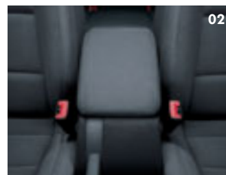
02 Front centre armrest.

The importance of comfort and convenience cannot be over-emphasised. Choose from this range of factory-fitted options to create an interior that meets your individual needs, and makes life just that little bit more comfortable and convenient. From 2Zone electronic climate control to a front centre armrest, from a sunroof to a Winter pack, these essential luxuries are designed to help you relax and take the stress out of driving, adding not only a touch of luxury, but also providing invaluable practical assistance.