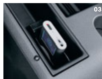
03 iPod preparation.

When it comes to in-car entertainment systems and communications packages, those looking to install a technologically advanced or upgraded system are spoilt for choice. Whether you require concert hall acoustics, the latest navigation system or iPod integration, these factory-fitted options provide state-of-the-art technology and connectivity. Choose the system that best meets your needs, then sit back and enjoy the benefits.